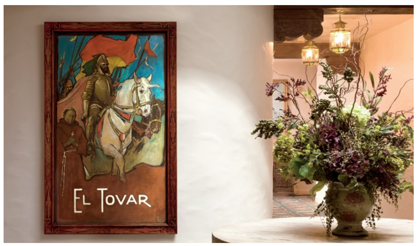
Gerald Cassidy's painting \it El\ Tovar in a hallway of The Terrace at La Fonda.