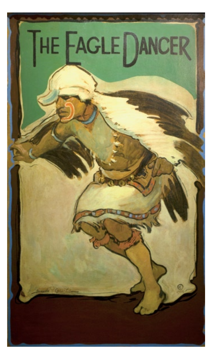
Gerald Cassidy's painting The Eagle Dancer is part of the La Fonda Collection.

Art in public places adds to the aesthetic ambience of a space but suffers from exposure. The days of smoking and the inevitable accumulation of grime dimmed the vibrant colors of the Cassidys. Today they look the way Cassidy intended. (Jenny also pointed out a mural by another artist that had been cleaned of decades of "fajita grease" and relocated.)